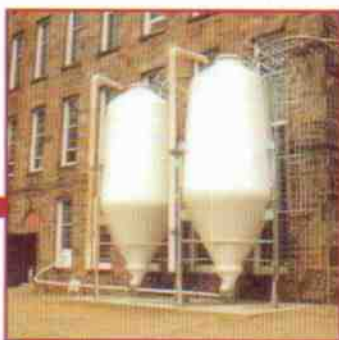
MODEL #2120 1,000 cu. ft. capacity. Calcium Chloride Storage Milwaukee County - WI

Factory assembled tanks are easily transported and erected at your site. Our trained & experienced installation crews work with you to guarantee proper installation.