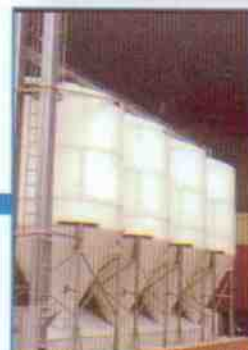
MODEL #2120 1,000 cu. ft. capacity. Borax Storage - Spencer, WI