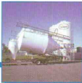
MODEL #2129 1,450 cu. ft. capacity. Goose Island Brewery - IL