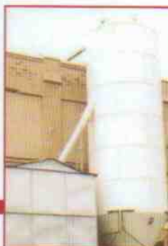
MODEL #2135 2,050 cu. ft. capacity. High Protein Seed Hulls Harrison, NJ